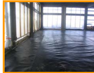
HDPE Liner Installation