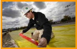
Audi Milwaukee Vapor Barrier Installation