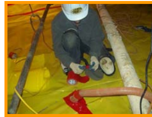
Decontamination Services and Vapor Barrier Installation