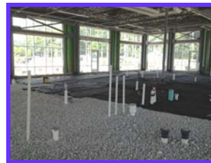
Placement of Permeable Stone and Geosynthetic Fabric Layer