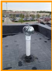
Passive Exit Vent

Impermeable liner, vapor, and methane collection system installation are Dakota's specialties. The project was completed ahead of schedule, and our quality work was featured in the Daily Reporter.