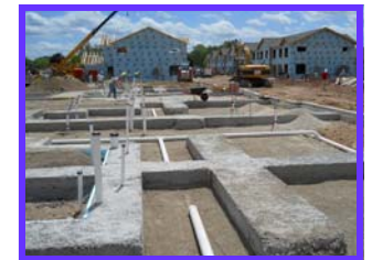
Vapor Collection System Installation